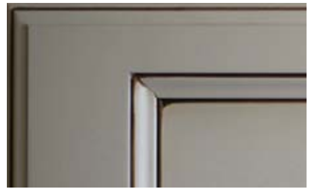
Painted and Accented