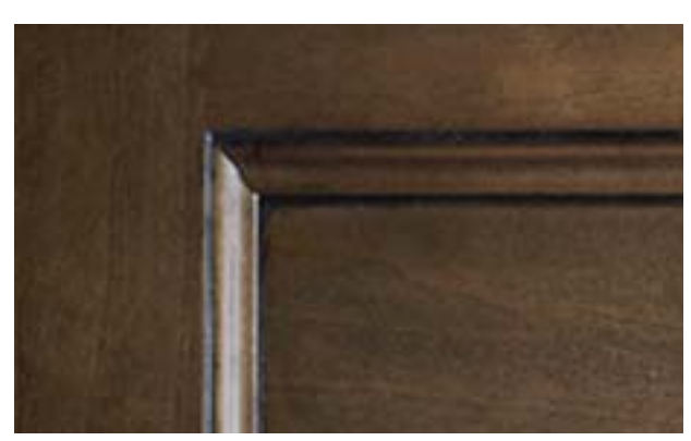
Stained and Glazed