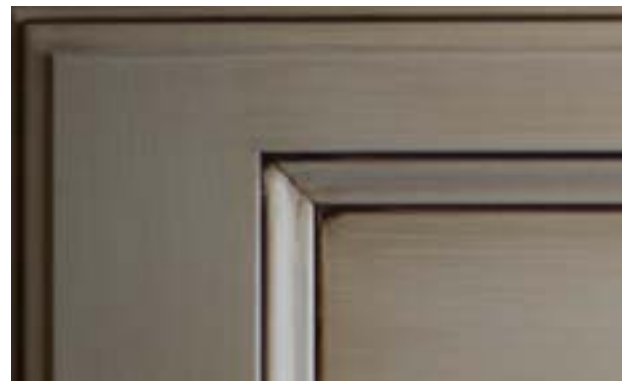
Painted and Brushed and Accented