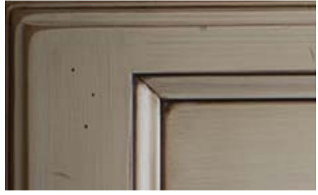
Painted w/ Country finish (Country includes brushed, accented and distressed - Country is also available in a stained finish)