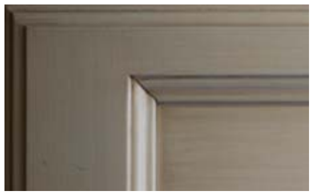
Painted and Brushed